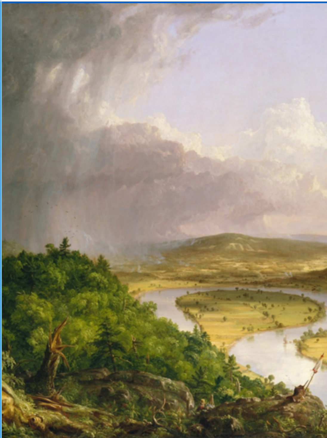
After a Thunderstorm -The Oxbow | Cole, Thomas, 1801-1848